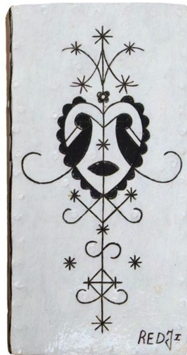
Reginald Senatus, "Ezili", 10" x 5", oil, rubber, wood.