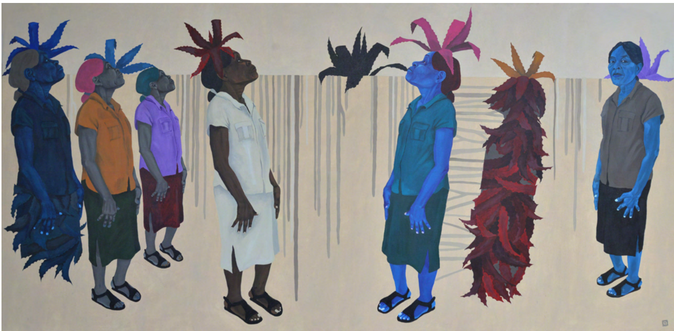
Nou la ansanm, 2019. Acrylic on canvas 121 23/25 × 243 21/25 in

When posed the question if her mother Kettly Mars encouraged her creativity, she explains that "Both my parents gave me the freedom to cultivate my love of knowledge and of experimentation. I had the run of the library and no books were forbidden, be it the very "adult" novels, the technical science manuals, and the colorful art monographs. They never tried to guide my explorations in any one direction beyond calling my attention to a certain notion or subject or bringing clarification on certain points."