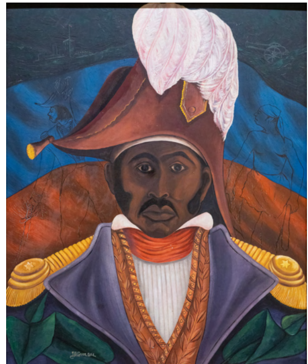
Portrait of Jean-Jacques Dessalines, n.d by Jacques-Enguerrand Gourgue