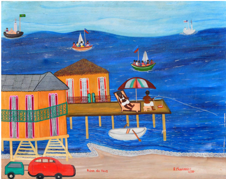
Rêve de tous, Etienne Chavannes, Oil on canvas, 30 × 24 in